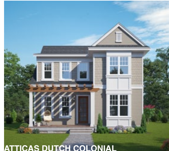
ATTICAS DUTCH COLONIAL