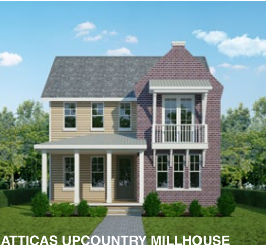
ATTICAS UPCOUNTRY MILL HOUSE