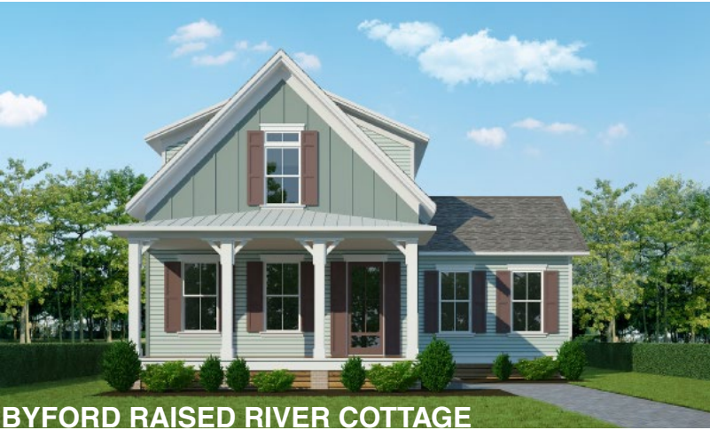
BYFORD RAISED RIVER COTTAGE