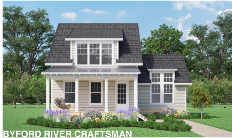
BYFORD RIVER CRAFTSMAN